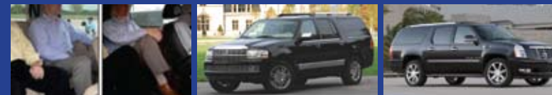
Navigator 3rd-row room Escalade 3rd-row room Lincoln Navigator L Cadillac Escalade ESV

Limousines based on Navigator L are available from our Qualified Vehicle Modifiers. See your QVM for details.